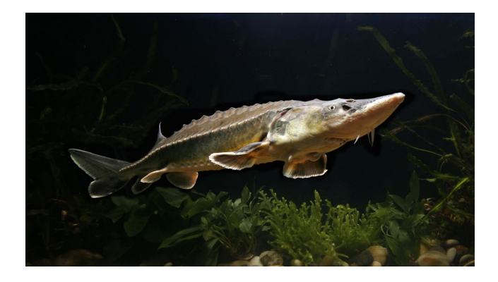
FIGURE 2 The Chinese sturgeon.

Non-native escapees can also destroy the genetic integrity of native species through genetic pollution, which can reduce genetic diversity, alter population structure and cause species extinctions in native ecosystems. In China, about 10 NAS have the potential